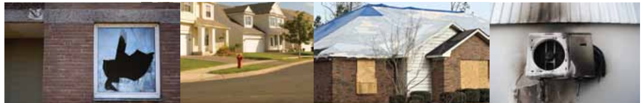
Real-time photos of exterior and surrounding conditions are provided with a report providing added visual and written viability to the conditioned valuation model.